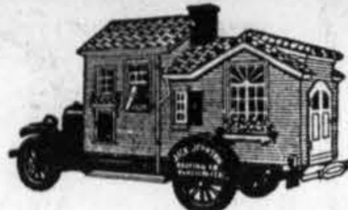
Re-tarring your old roof adds ten years' wear to it

IN NON-FADING FAST COLORS Wood, Asphalt and Asbestos Backed by a Long Term Guarantee