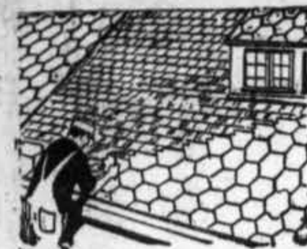
Lock Shingles that Cannot LEAK, CURL or BLOW UP